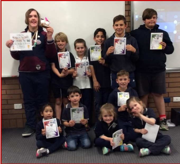
Primary School Award Winners